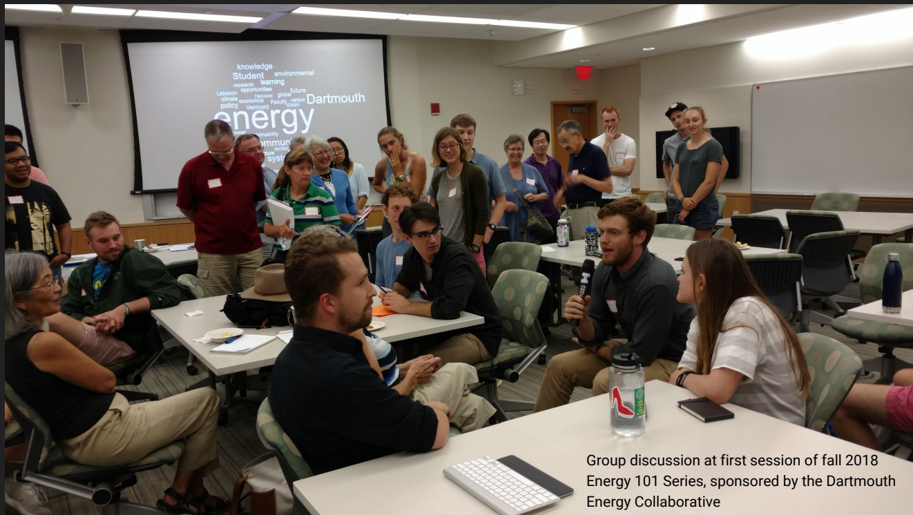
Group discussion at first session of fall 2018 Energy 101 Series, sponsored by the Dartmouth Energy Collaborative

be a hub of vibrant collaboration and prepare the next generation of experts.